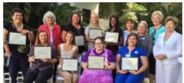
The Woman's Exchange presented $1,000 awards to 10 women. Scholarship funds may be applied toward tuition, fees and books.

Since 2001, the Woman’s Exchange of St. Augustine has helped women who are returning to college to advance their careers. This year, the organization presented $1,000 awards to 10 women with proceeds from The Woman’s Exchange’s activities and personal donations and two member-sponsored funds. Scholarship funds may be applied toward tuition, fees and books. The Woman’s Exchange Scholarship Committee works with St. Johns River State College Foundation. The College processes all applications based on specific criteria for each award that is available from the foundation office.