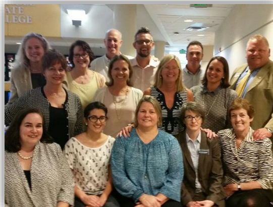
FCRD Board Members past and present

Greetings! As the incoming Chair of FCRD, I begin this term with a sense of gratitude and stewardship. As an alumni of Palm Beach State College, I am humbled to lead this organization towards its vision: to offer members professional development opportunities and effective