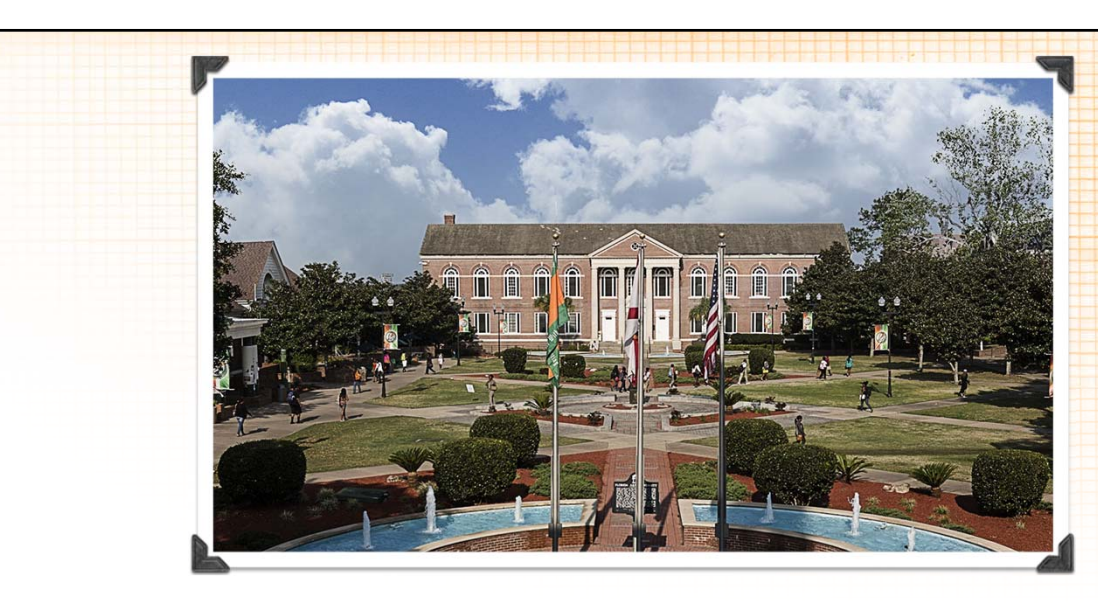
"At FAMU, Great Things Are Happening Every Day."