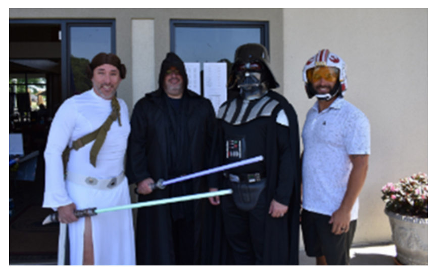
Best Dressed Team (4 grown men) went to the Hurd Real Estate Company.

With the event held on May 4th, teams enjoyed the May the Fourth Be With You theme and dressed to impress.