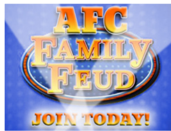
Gulf Coast kicked off the year with a humorous membership drive “AFC Family Feud”

The membership drive lasted the entire week before classes began and also included a breakfast of coffee and doughnuts, an ice cream social and a lunch served to all employees between workshops. The focus on fun and camaraderie with a purpose paid off – Gulf Coast AFC membership has increased by 14% since the “Welcome Back” kickoff!