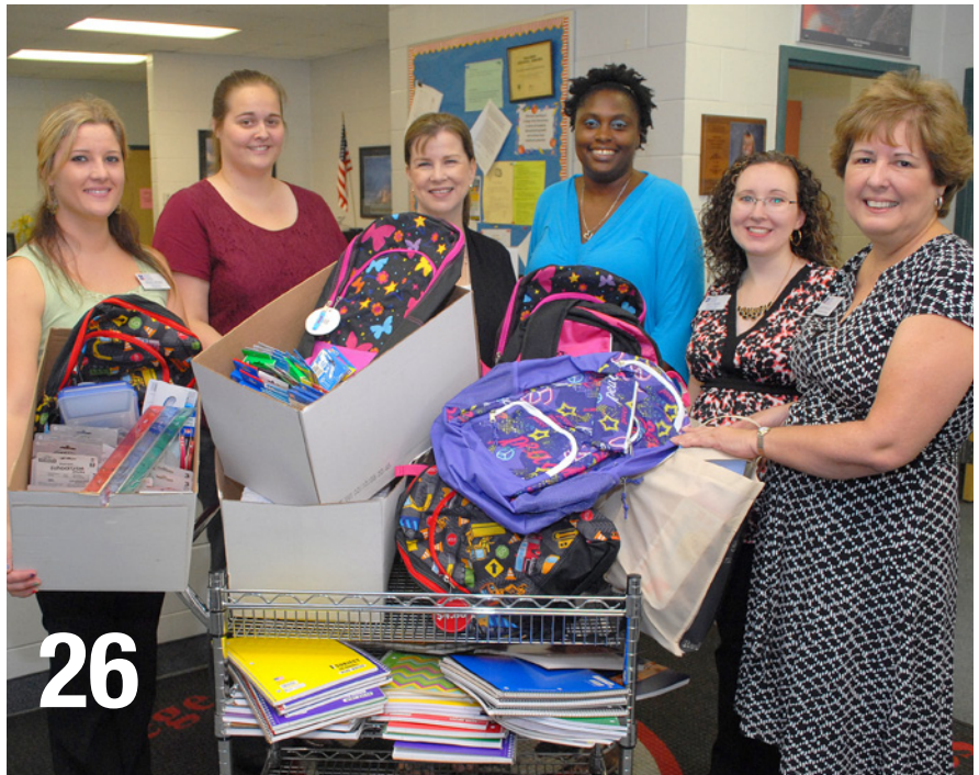
Members of the College of Central Florida chapter hold a school supply drive to benefit local elementary school students.